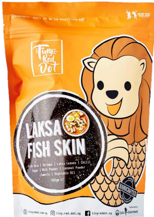
Laksa Fish Skin (100g)