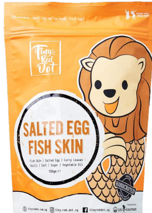
Salted Egg Fish Skin (100g)