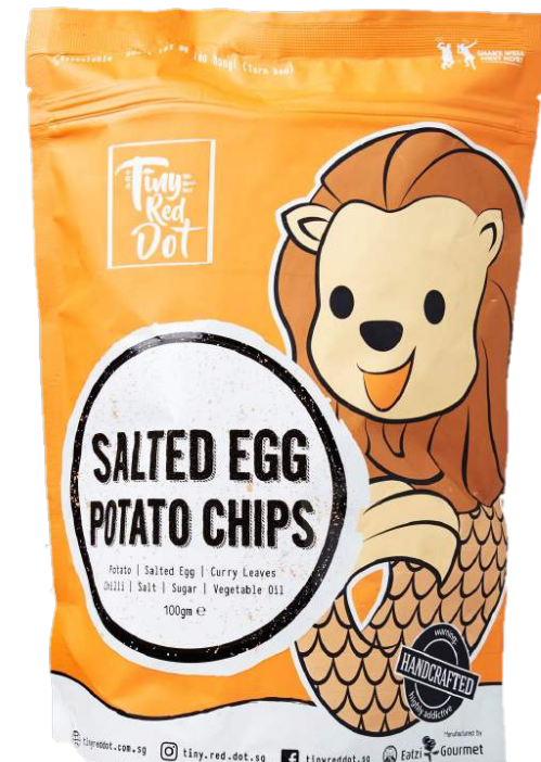
Salted Egg Potato Chip (100g)