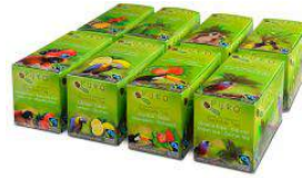
Fairtrade Flavoured Teas - Teabags