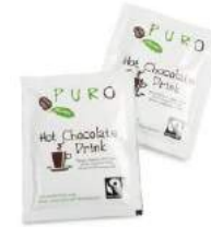
Fairtrade Hot Chocolate - Sachets