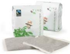
Coffee Pouches – for brewing machine