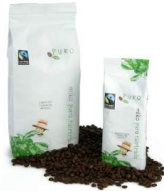
Fairtrade Coffee Beans – for vending machine