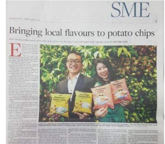
Business Times (Singapore) article Aug 7th, 2018